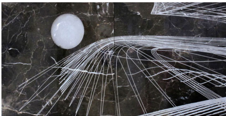
"Wireframe Landscape #2" by Colin Goldberg, 2006.