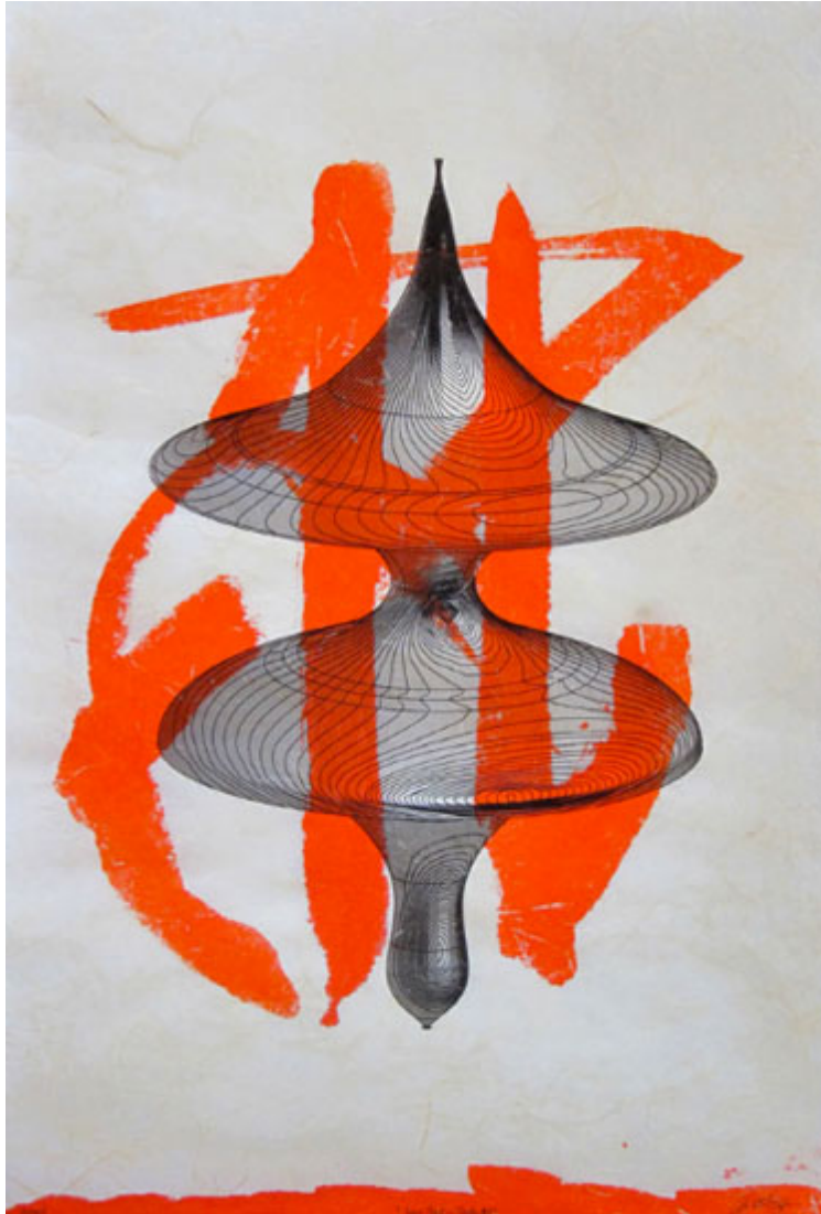
"New Plastic Shodo #6" by Colin Goldberg, 2013.

In New Plastic Shodo #6 , the artist uses a stylized calligraphic character that serves to simultaneously anchor the background portion of the picture plane while depth and a graceful rotational motion is provided by the geometric image that floats, seemingly effortlessly but with a certain dynamic persistence, in the work's foreground.