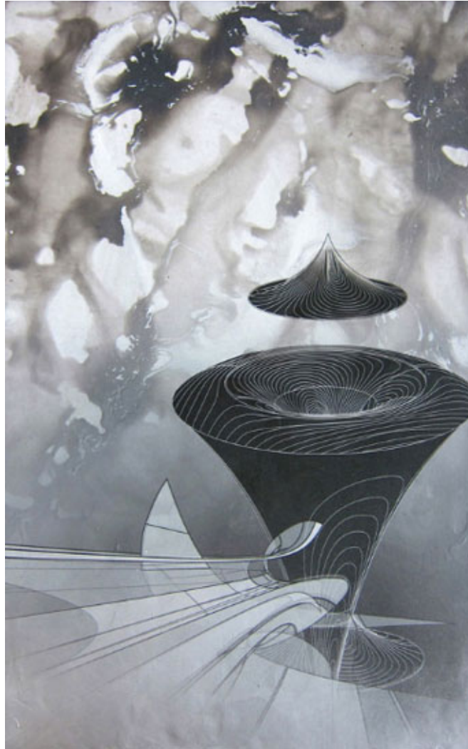
"Magnetic Resonance" by Colin Goldberg, 2011. Acrylic with pigment on canvas, 32 x 20 inches.

imagery vibrates with an understated intensity while at the same time the artist's confident use of negative space allows for the geometric elements to establish themselves assertively within the painting's organizational framework.