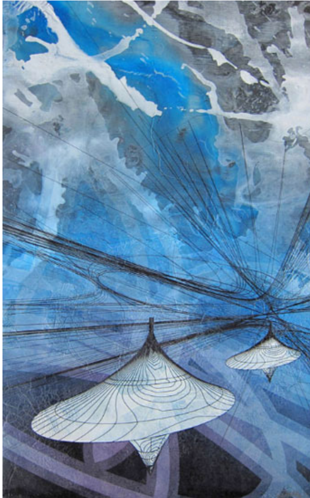
"Dynamic Dispatch" by Colin Goldberg, 2011. Acrylic with pigment on canvas, 32 x 20 inches.