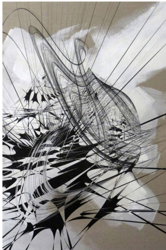
"623 Variation #3" by Colin Goldberg, 2014. Acrylic pigment and latex glaze on linen.

Further along these lines, the artist also channels the energy and intensity of contemporary Japanese graphic novels, known as “manga.” Examples can be seen in the series titled Variations (acrylic, pearlescent latex glaze and pigment on linen) as well as in some smaller pieces, like Itadaki (gouache and pigment transfer with liquid polymer on birch panel, 2014) and Kawa (acrylic and pigment with liquid polymer on birch panel, 2014).