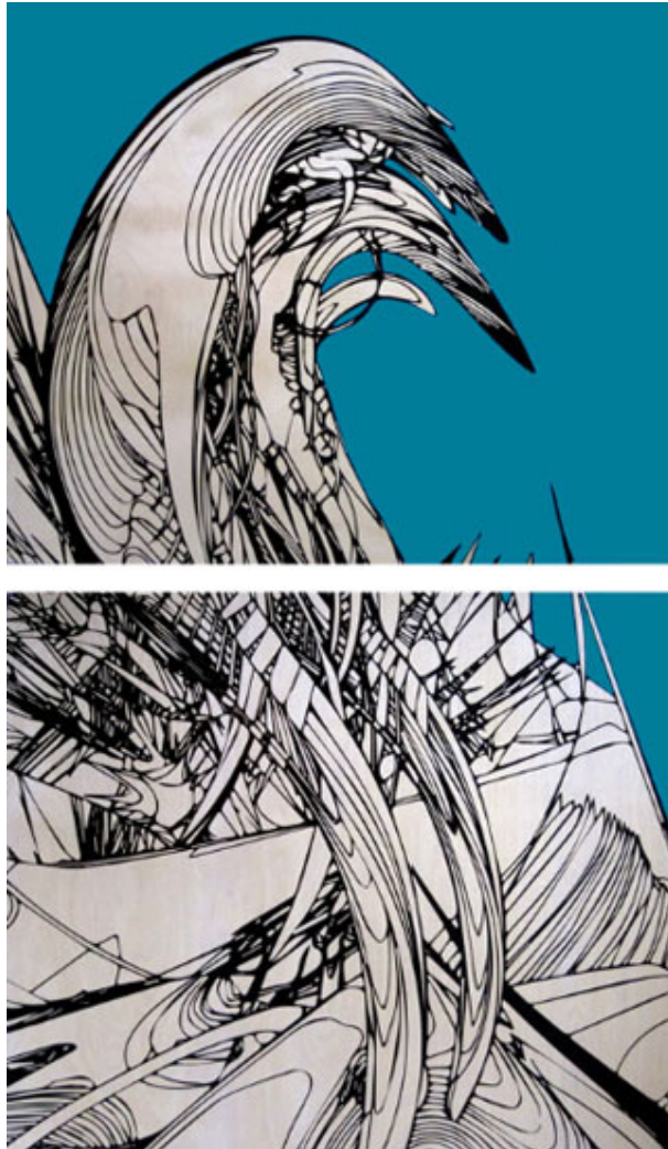
" Iruka " by Colin Goldberg, 2013. Acrylic and pigment with liquid polymer on birch panels, Diptych, 41 x 24 inches.

In Iruka (pigment and acrylic on birch panels with liquid polymer, 2013), for example, the artist manipulates the digital elements so that they take on a configuration and sense of organic power that is strikingly similar to the effect of the ocean waves in Hokusai's seminal print The Great Wave off Kanegawa from the series 36 Views of Mount Fuji . There's a similar sensibility at work in Inazuma (acrylic and pigment with liquid polymer on birch panels, 2013) that seems, aside from the three-panel motif, to gently echo the compositional structure of a later work by Hokusai titled Kaijo no Fuji .