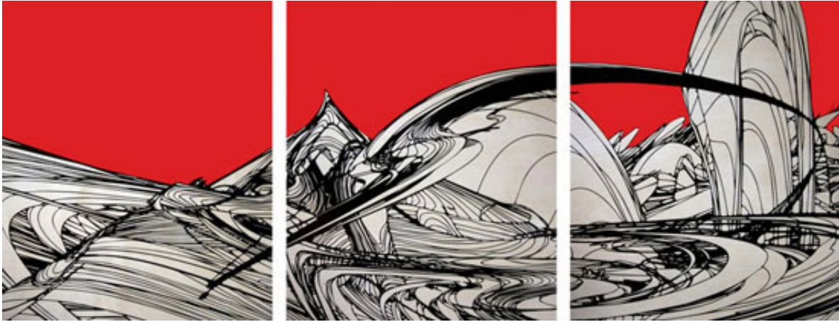
"Inazuma" by Colin Goldberg, 2013.

Acrylic and pigment with liquid polymer on birch panels, triptych, 24 x 62 inches.