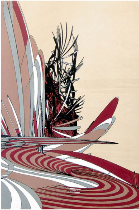
"Itadaki" by Colin Goldberg, 2013. Gouache and pigment transfer with liquid polymer on birch panel.