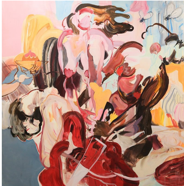
Wynnie Mynerva, Story of Revenge (2021).