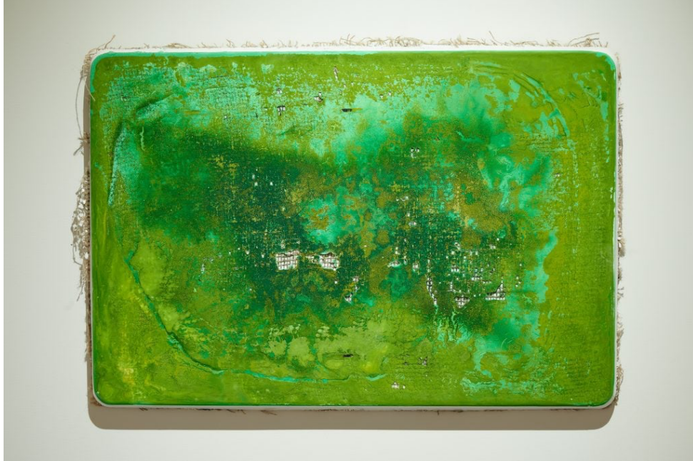
William Eric Brown, ColorStatic #3 (2020).