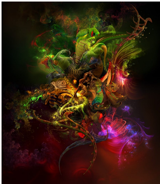
Andy Thomas, Abstract Parrot 2 .