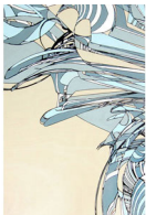
Kesshō , 2013. Gouache and pigment transfer with liquid polymer on birch panel 18 x 12 inches $1200