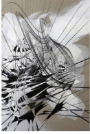
623 Variation #3 , 2014. Acrylic, pigment and latex glaze on linen 48 x 32 inches $3500

(3 works above available as a triptych for $8500)