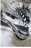
623 Variation #1 , 2014. Acrylic, pigment and latex glaze on linen 48 x 32 inches $3500