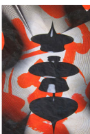
New Plastic Shodo #8 , 2013. Sumi ink, acrylic and pigment on Kinwashi paper 19 x 13 inches $750

(4 works above available as a set for $3000)