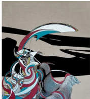
Nami , 2012. Oil on linen 36 x 40 inches $4000