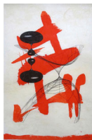
New Plastic Shodo #2 , 2011. Sumi ink, gouache and pigment on Kinwashi paper 19 x 13 inches $750

(6 works above available as a set for $4500)