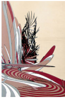
Itadaki , 2013. Gouache and pigment transfer with liquid polymer on birch panel 18 x 12 inches $1200