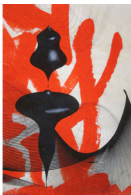
New Plastic Shodo #5 , 2013. Sumi ink, gouache and pigment on Kinwashi paper 19 x 13 inches (48 x 33 cm) $800