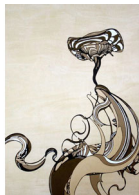
Hana , 2013. Gouache and pigment transfer with liquid polymer on birch panel 18 x 12 inches $1200

(6 works above available as a set for $4500)