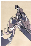
Kuren , 2013. Gouache and pigment transfer with liquid polymer on birch panel 18 x 12 inches $1200