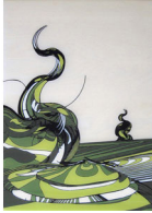
Shokushu , 2013. Gouache and pigment transfer with liquid polymer on birch panel 18 x 12 inches $1200