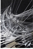
623 Variation #2 , 2014. Acrylic, pigment and latex glaze on linen 48 x 32 inches $3500