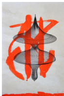
New Plastic Shodo #6 , 2013. Sumi ink, acrylic and pigment on Kinwashi paper 18 x 12 inches (48 x 33 cm) $800