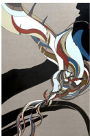
Tsuru , 2014. Oil on linen 48 x 32 inches $4500